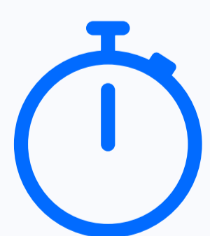
Fig 1: Footfall density monitoring insight